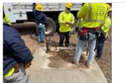
Finishing off by capping the electric conduits.