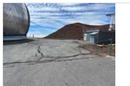
Transformer removed and area secured.