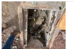
Finish work and labeling electric cable