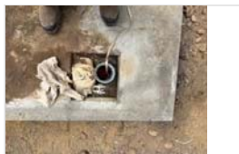
Conduit holes capped.