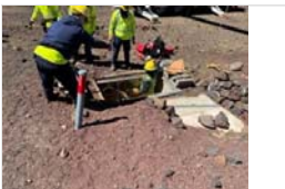
Disconnecting cable from pullbox.