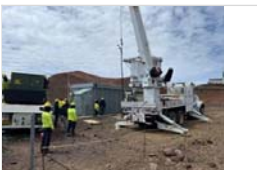
Removing electric cables.