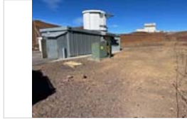
Transformer on concrete slab.