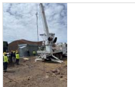
Removing electric cables.