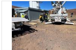
HELCO getting ready crane.