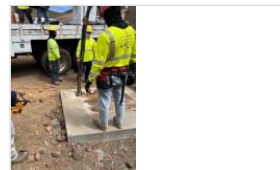
Pulling electrical cables with crane.