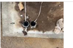
2 conduit holes to be capped.