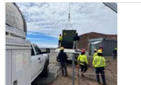
Transformer loaded on truck.