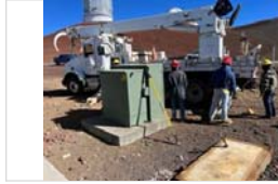
HELCO prepping site.