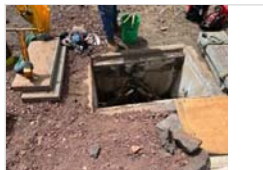
All done with taping off and prepping.