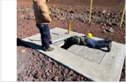
HELCO personnel checking underground pull box.