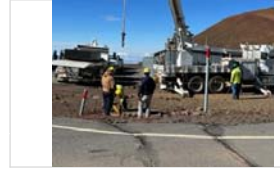
HELCO taking measurements and prepping site.