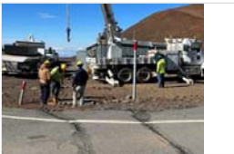
HELCO prepping and making precautions.