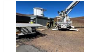
HELCO getting ready crane.